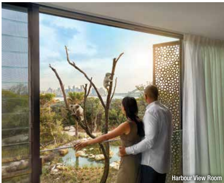
Harbour View Room