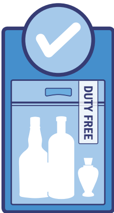
Duty Free products must be cleared

You are required to have your Duty Free liquid, aerosol and gel products cleared before boarding your flight.