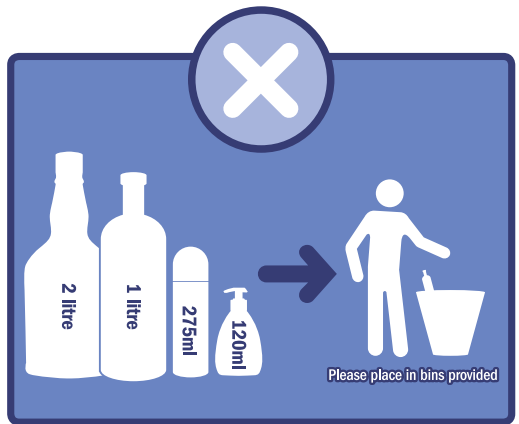
All other liquid, aerosol and gel products must be surrendered

If your Duty Free products are cleared you will be able to carry them through the screening point and onto your flight.