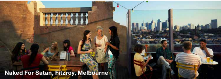
Naked For Satan, Fitzroy, Melbourne