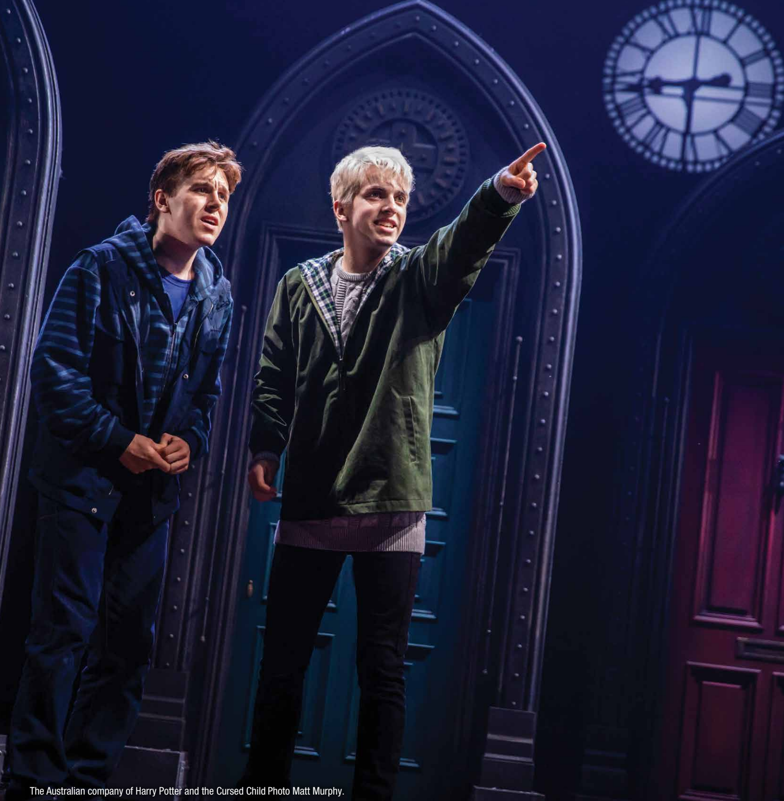
The Australian company of Harry Potter and the Cursed Child

Call, click or see your preferred travel agent