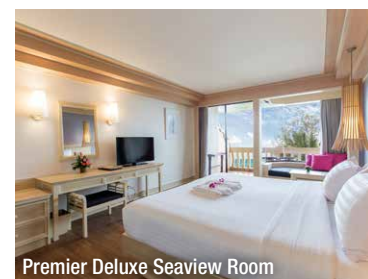
Premier Deluxe Seaview Room